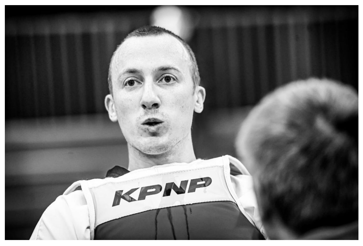
Easy to Learn

One of the great draws to Taekwondo is that it's easy to learn the basics.