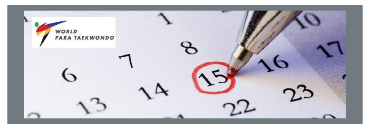
2023 (Provisional calendar subject to change)

• 2023 WT President's Cup Europe (G2) - February 4-5 - Istanbul Turkey (International Para Taekwondo Coach Certification Level I required for all coaches)