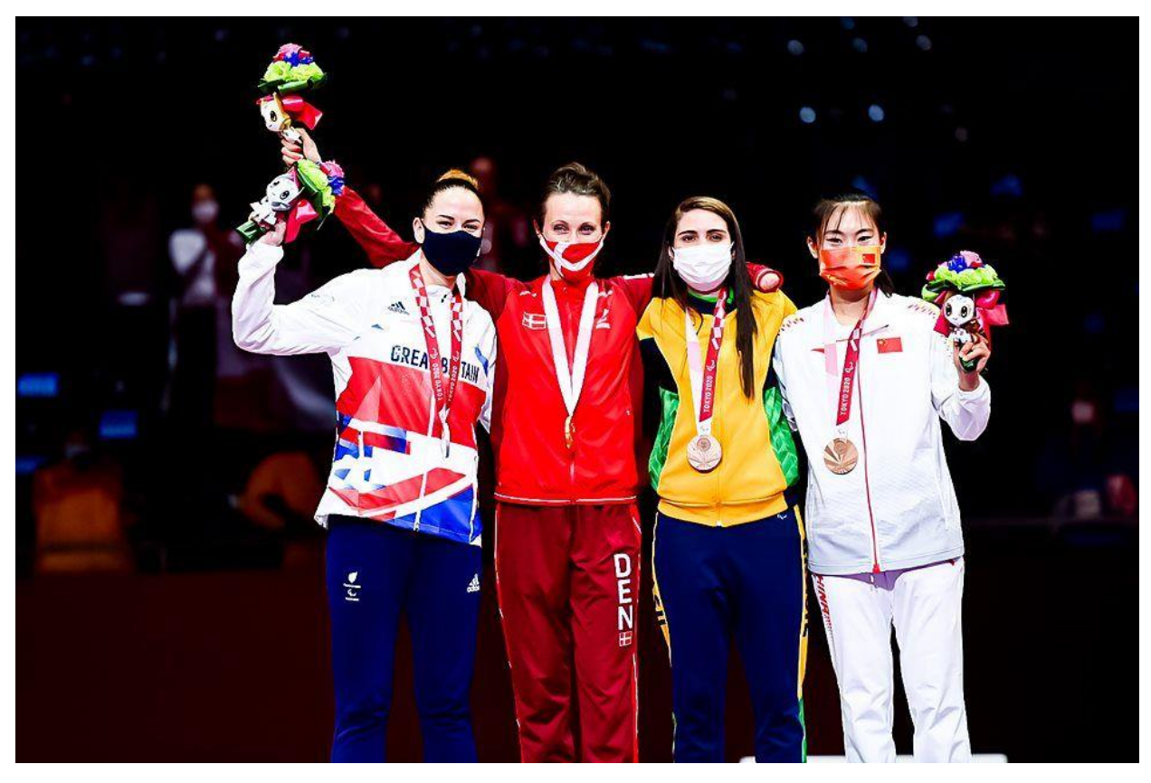
Para Taekwondo offers unprecedented opportunities for its athletes – from prestigious awards and financial prizes to travel to exotic locales and competing at the Paralympic Games. No matter what your goals in sport are – Para Taekwondo has you covered.

So, you want to go to the Paralympics. You want to hear the roar of the crowd. To feel the adrenaline of a once-in-a-lifetime 'ring walk'. The glory of standing on the Paralympic podium.